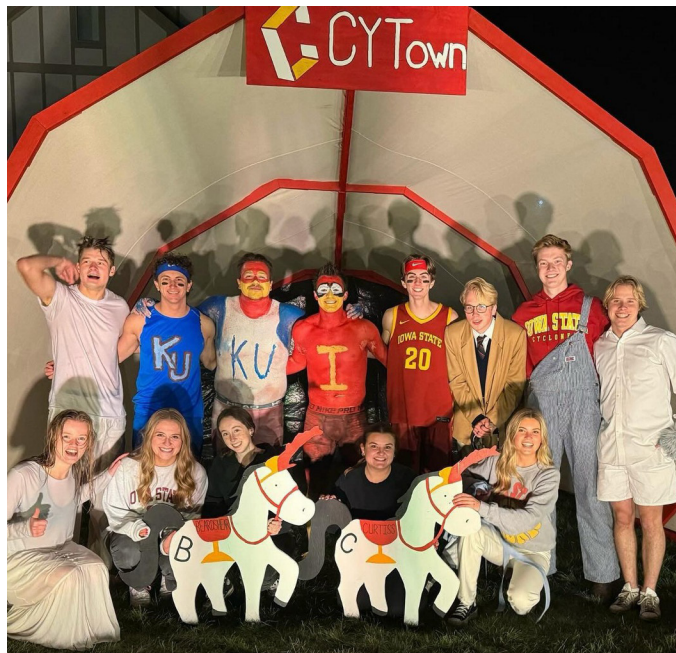
Our pairing's cast for the Homecoming lawn display.