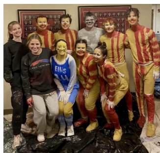
Left: Getting painted for YLH is fun!