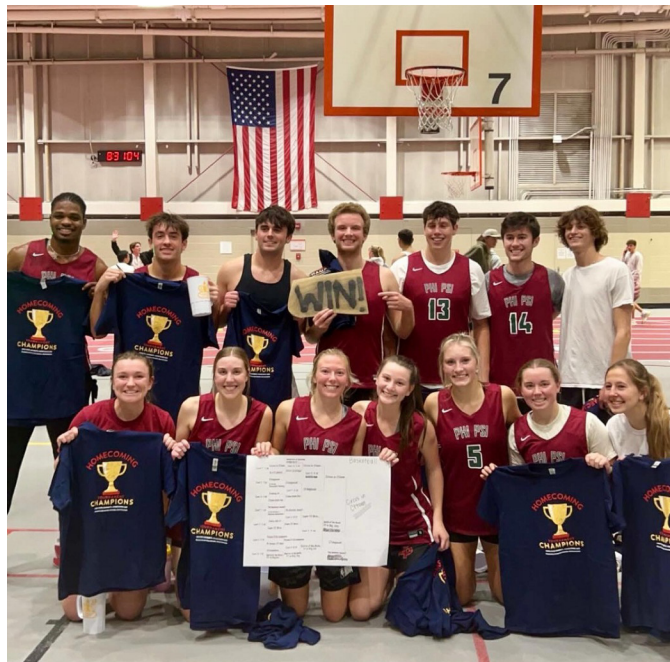
Winning Homecoming tournaments (basketball here) is even more fun.