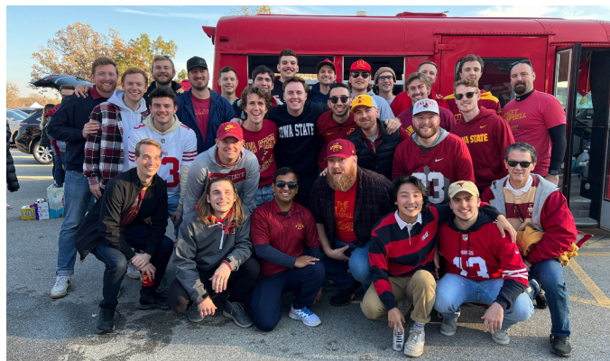
Just some of the alumni at the Homecoming tailgate.