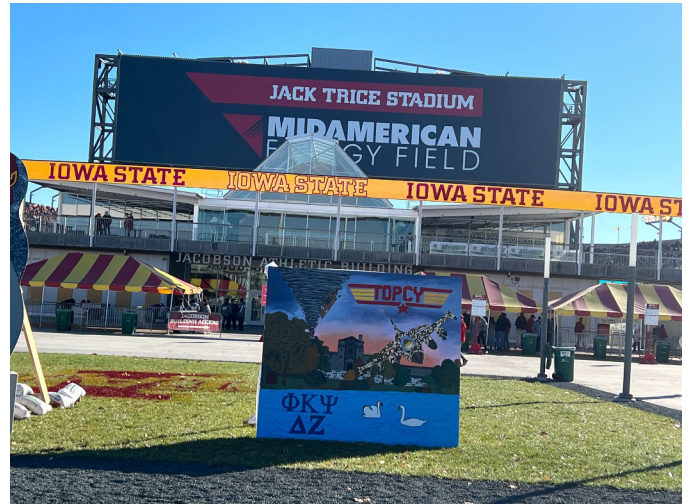
Our homecoming banner in front of Jack Trice Stadium.