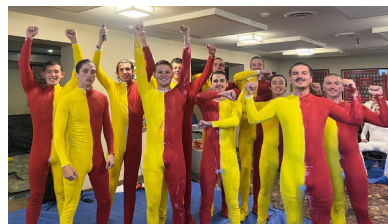
Left: Our homecoming banner on central campus.