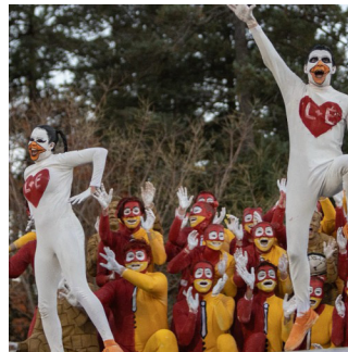
Our Yell Like Hell team in action!