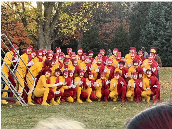
Iowa Beta's first place Yell Like Hell team, dressed and painted for the occasion.